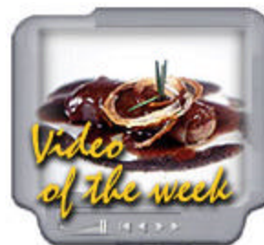
Potato Crepe with Lamb Kidneys, Boletus Fungus and 'Rosti' Onion