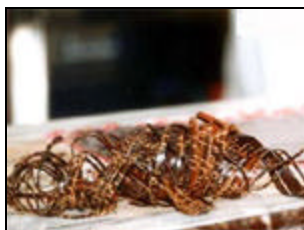
Dôme Papouasie Earl Grey